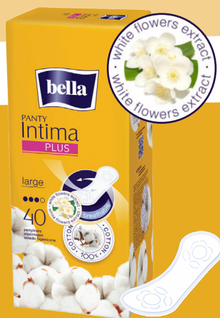
Plus Large 176 mm