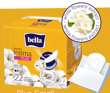
Plus Small 140 mm