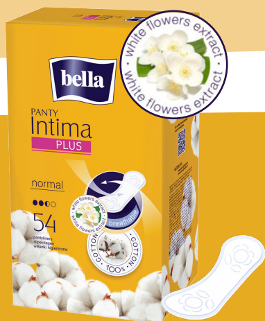
Plus Normal 151 mm